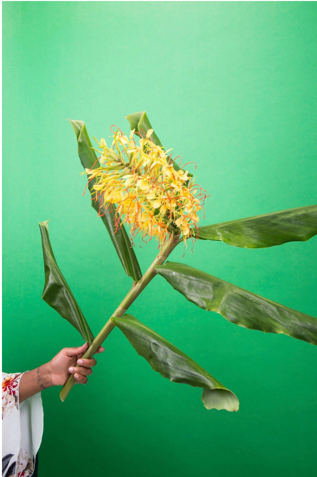
Figure 5 Bloom

This song is about finding my love and appreciation for my heritage and culture in my early adulthood. Having discovered this part of me and acknowledging my heritage enables me to write my own narrative and fill in my future's unwritten pages. - Laila