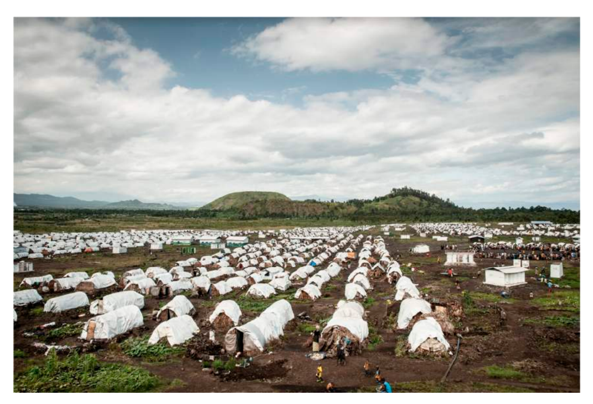
Figure 3. Hundreds of thousands of people have been forced to flee their homes to escape violent conflict in the Democratic Republic of Congo. Many ended up living in displacement camps like this one outside the city of Goma in the Congo.

Along with data, photos, and narratives from RRB research participants, the thrust of the exhibit, however, is portraits of RRBs taken by project collaborator Colin Crowley for this purpose, separately from the research process. It was very important to him that portraits did not reinforce negative stereotypes of refugees. He wanted images that went against the stereotype of the destitute, hopeless refugee and instead presented the public with visions of strong, accomplished, and cultured individuals. Our collective hope is that the members of the public who view these photographs come away feeling that, regardless of our backgrounds, our futures are inextricably tied together, and that these neighbors have more to offer than some may have previously understood (see Figures 4–7).